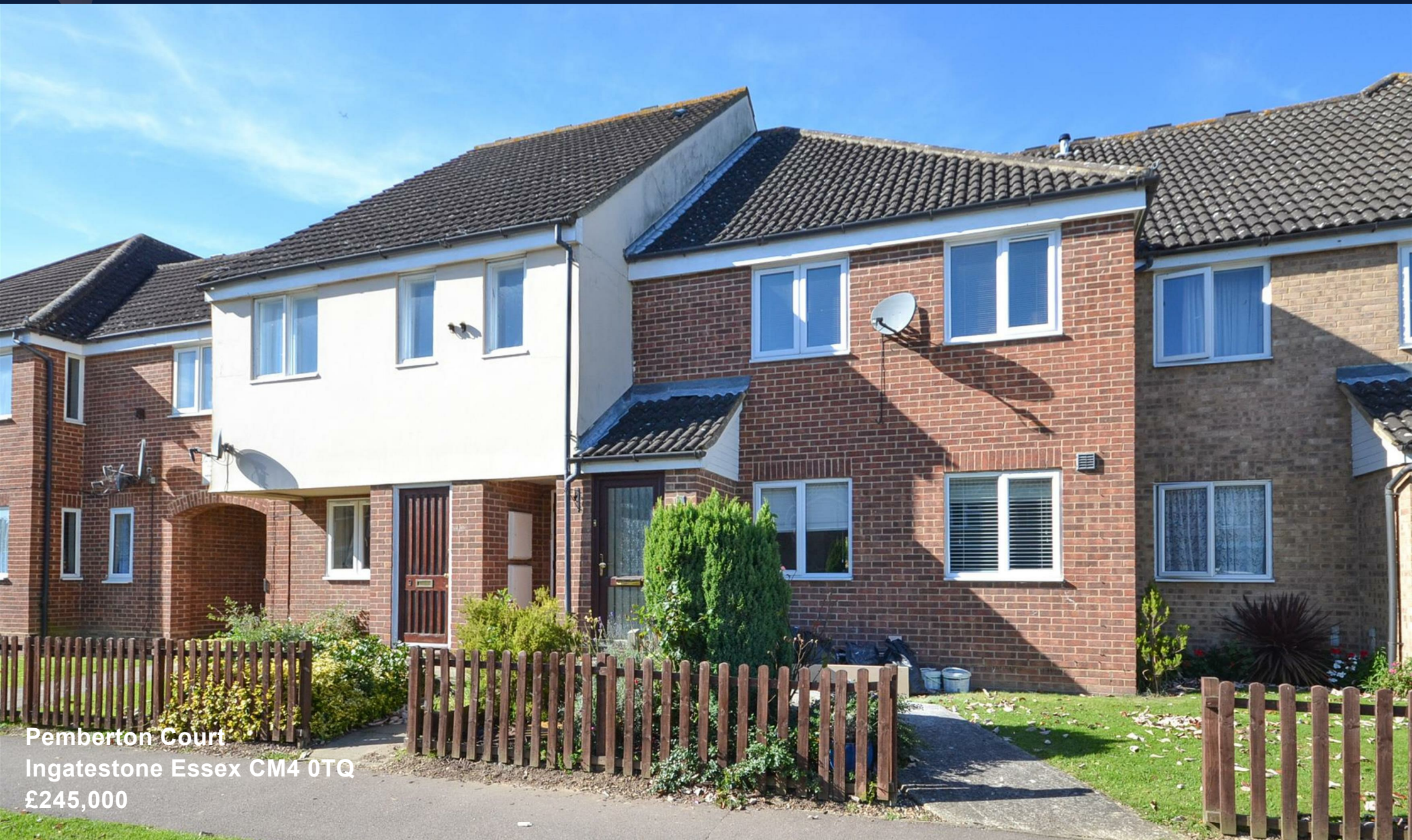
Pemberton Court Ingatestone Essex CM4 0TQ £245,000